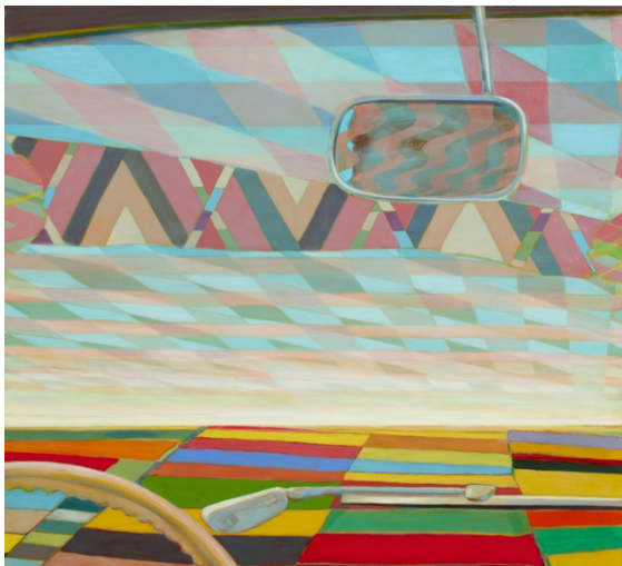
Rear View , 2019, Oil on linen, 40 x 44 inches

Betty Cuninghams Gallery is pleased to open External Drive , an exhibition of new paintings by Greg Drasler. This will be the artist's sixth exhibition with the gallery, located at 15 Rivington Street, New York, NY. The artist will be present for an opening reception on Thursday November 16, from 6-8 PM.