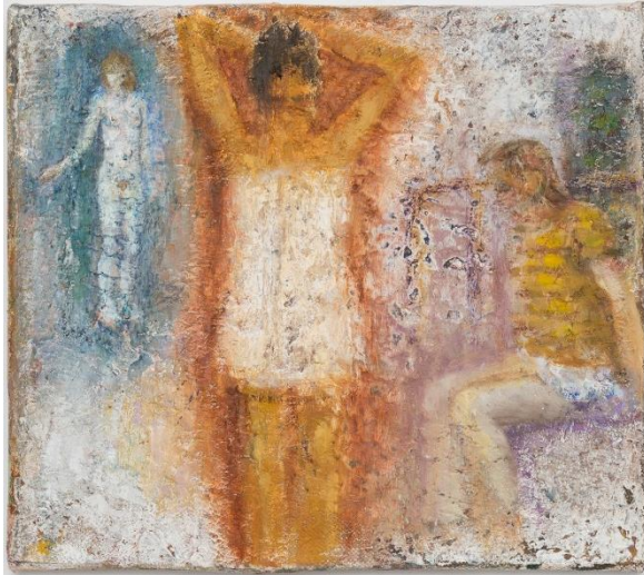
Trio , 2017, Oil on canvas, 15 1/4 x 17 in.

Reception: Wednesday, April 4 th 6 – 8PM