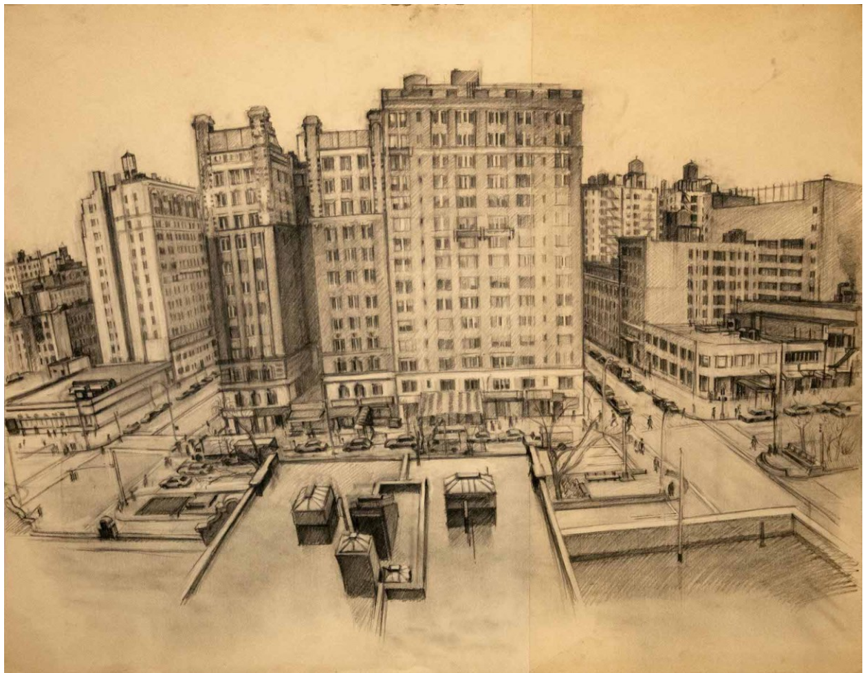
Rackstraw Downes, "Looking Down from the Window of a Friend's on the Upper West Side" (c. 1975), graphite on manilla paper, 24 x 30 7/8 inches