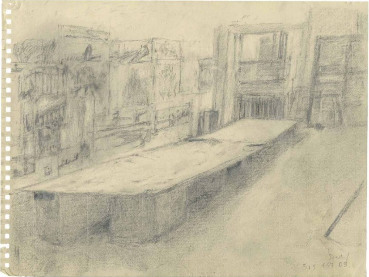
Rackstraw Downes, "In the Artist's Studio XVII" (2020), graphite on cream paper, 9.5 x 12.625 inches

Downes's drawing is the record of someone who did not join that crowd. The light lines and tender, gentle markings that evoke the rows of clothes, their empty volumes, as well as the sensitive interaction with the paper's rough surface, result in something rare in today's art world: a great, honest, unflinching view of a humdrum life, which, if we are lucky, we will one day live long enough to experience.