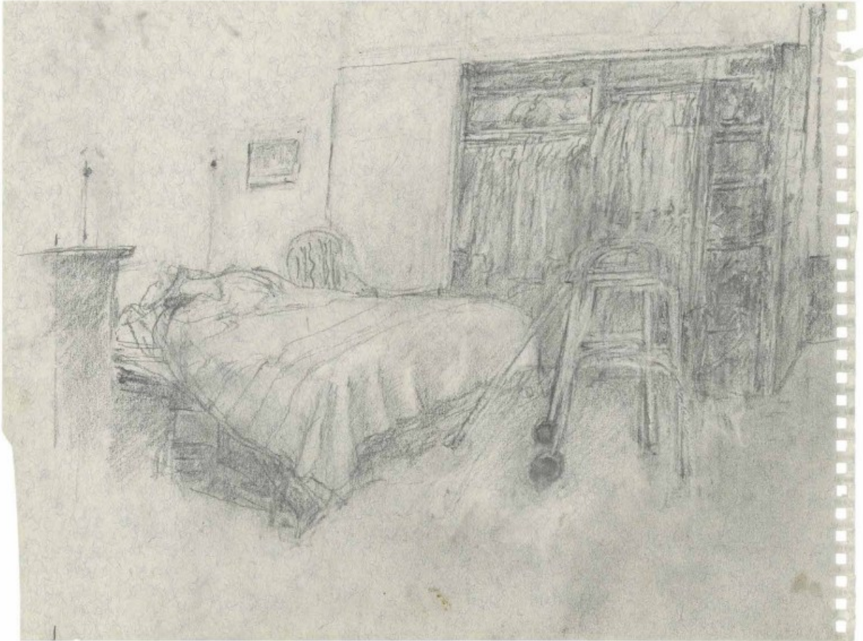
Rackstraw Downes, "In the Artist's Studio XV" (2020), graphite on cream paper with blue threads, 9.5 x 12.625 inches

In the drawings collectively titled In the Artist's Studio , it is evident that Downes can no longer stand outside on a busy street for hours to work on a drawing, or return to the same place day after day to make a painting. And yet, true to seeing and the joy it brings him, he focuses on his physical circumstances and the things before him: his bed, walker, closet, easel, brushes, books, chairs, radiator, work table, windows at one end of the room, and a wall of drawings.