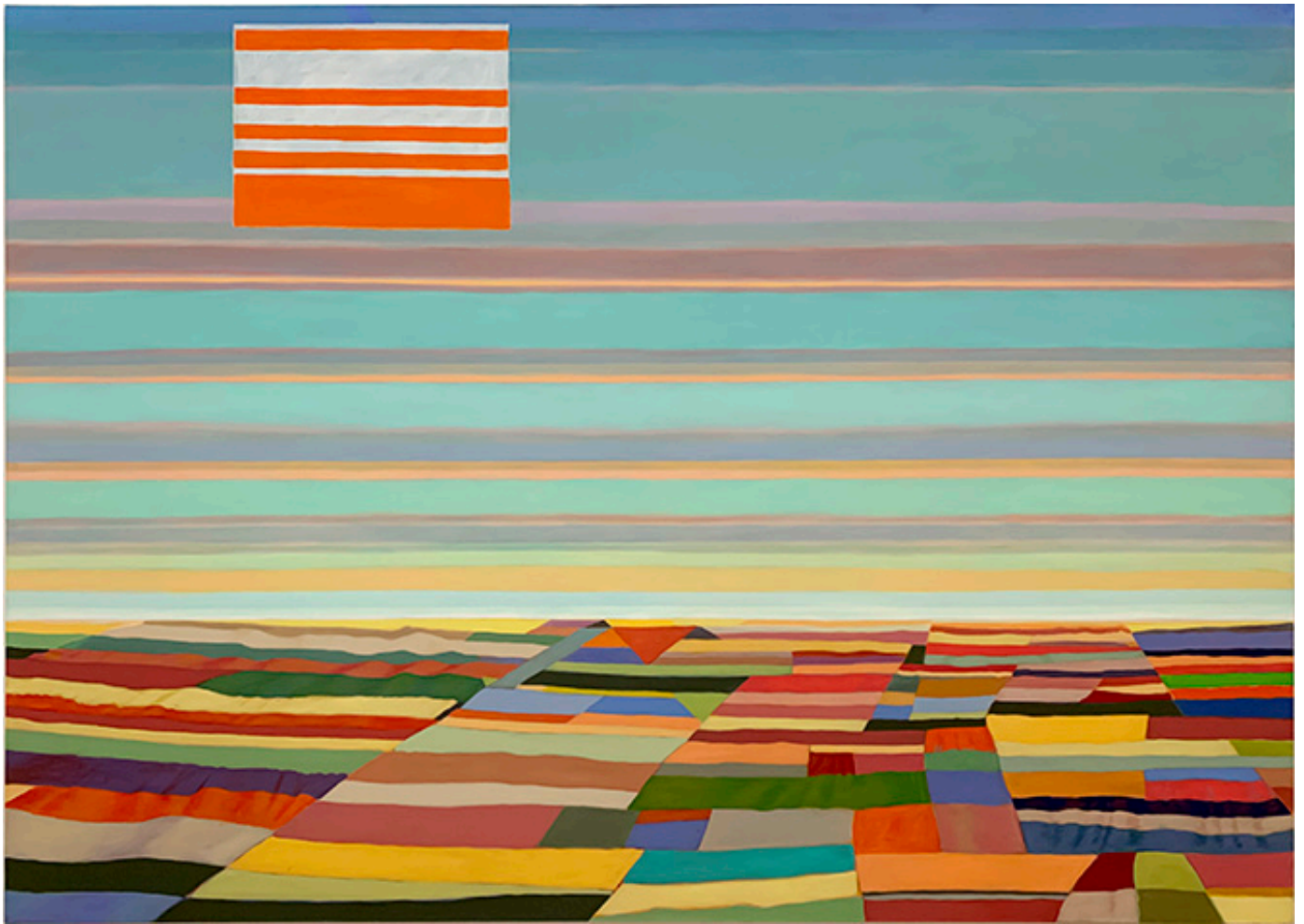
Rear View 2015 oil on canvas, 50×70 inches