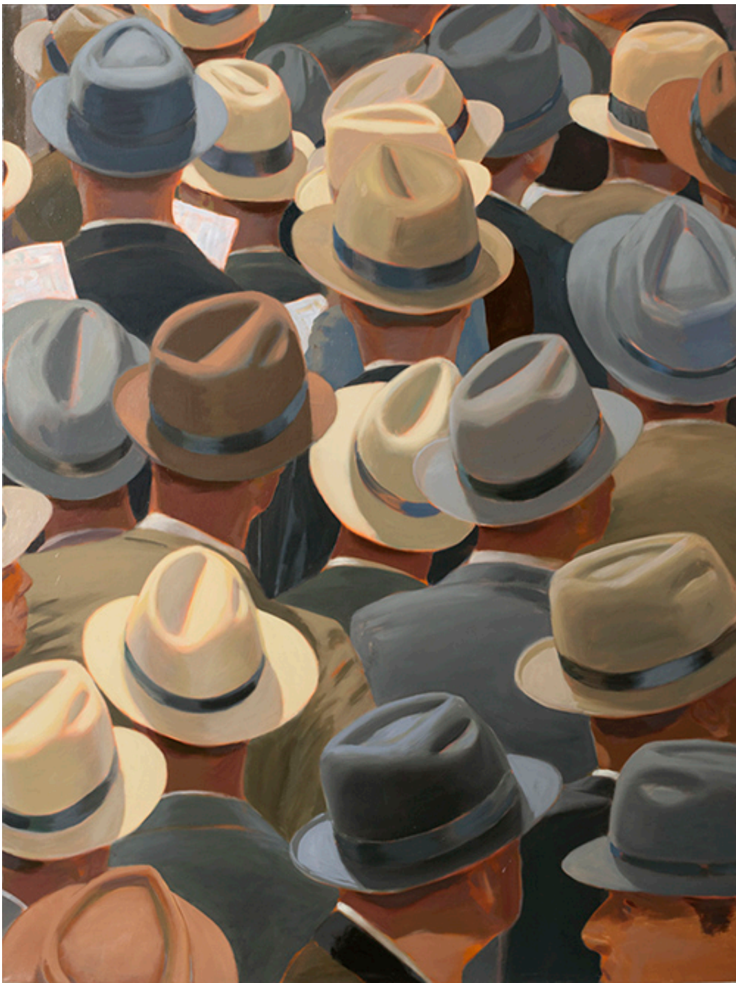
Late Edition 2020 oil on canvas 40×30 inches