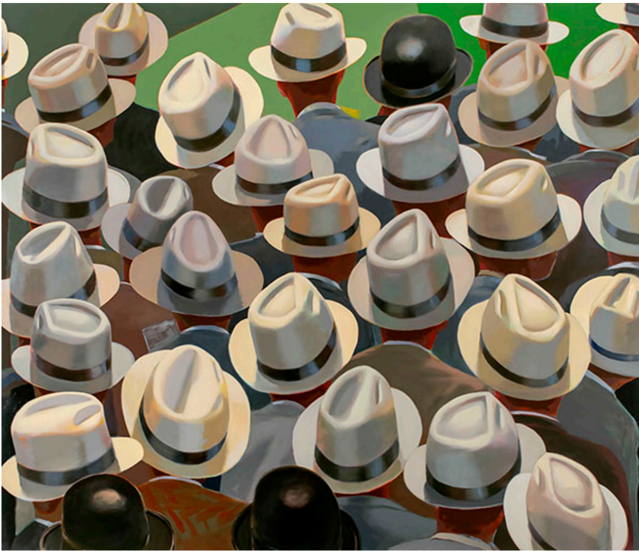
Land Rush 2021 oil on canvas 60×70 inches