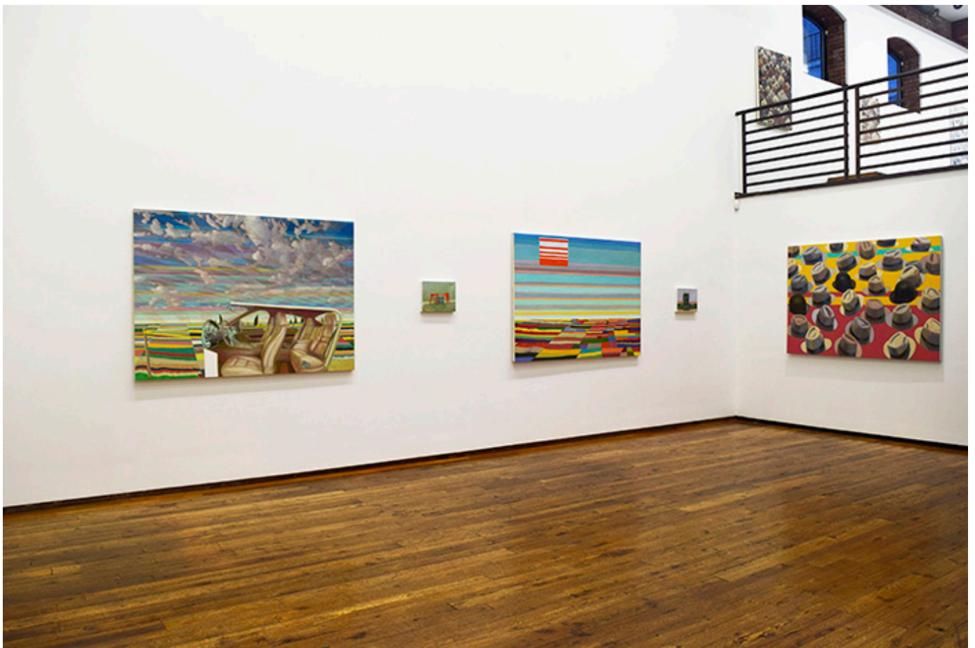
Crowded Places / Open Spaces installation Betty Cuninghame Gallery