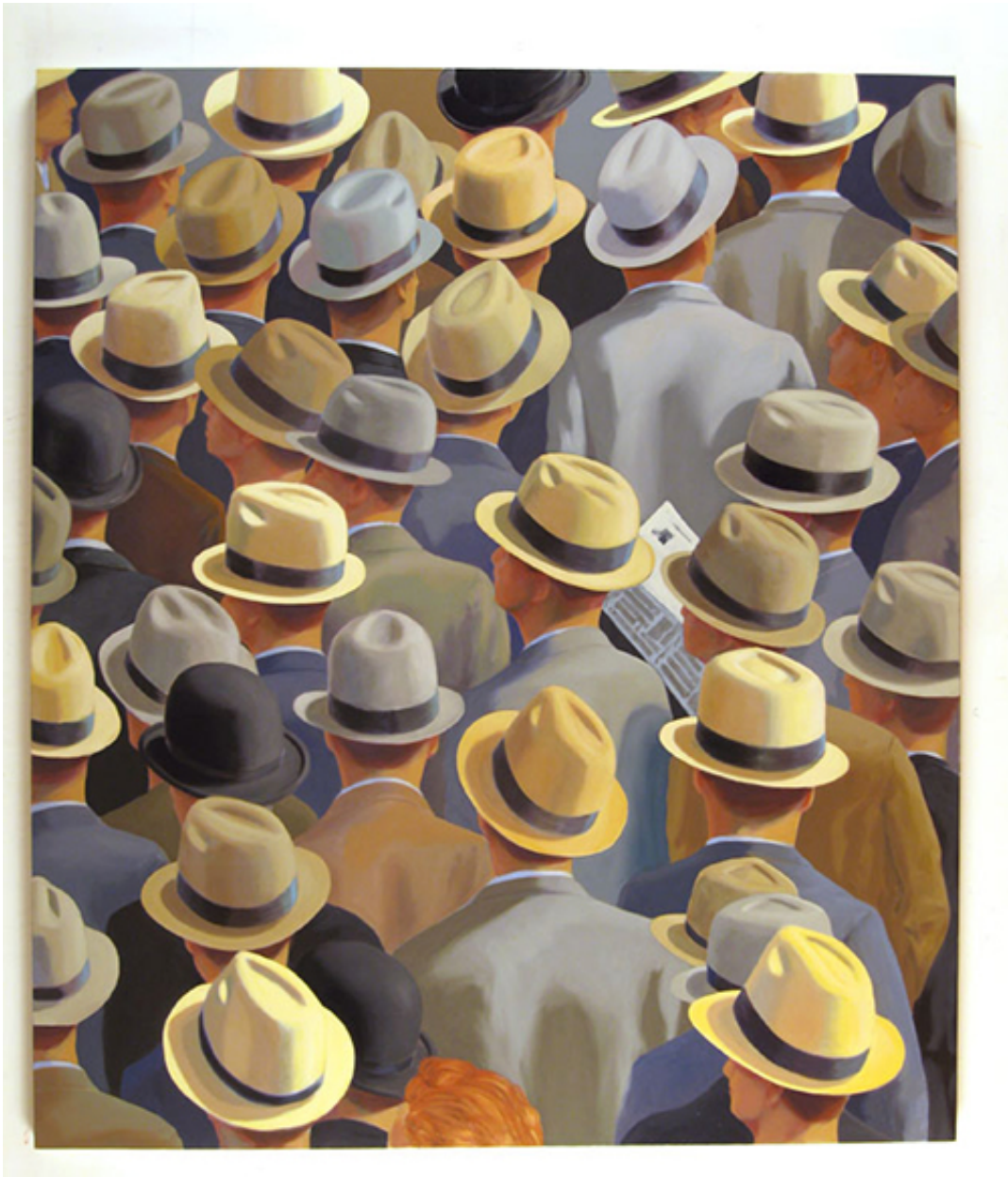
Back Pages 2005, oil on canvas 70×60 inches

In the Road House paintings, the pattern is used in a perspectival form to tie the atmosphere back to the horizon and suggest endlessness. The picturing of cloud computing as one pattern meets another suggests a shift in time and space creating a frame-to-frame cinematic effect.